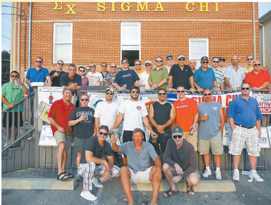
Eta Omicron Sigs gathered for the second annual golf outing.